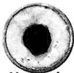
Limescale. Choking the life out of your Central Heating.